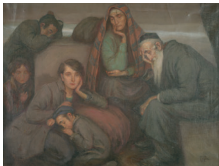
Wilhelm Wachtel, [Jewish Refugees], oil painting, 1937.

A quarter of a century later, the Center remains dedicated to its mission of preserving the richness of the Jewish past, mobilizing it to meet the challenges of the moment, and propelling the profound and diverse narrative of the Jewish people forward to inspire future generations.